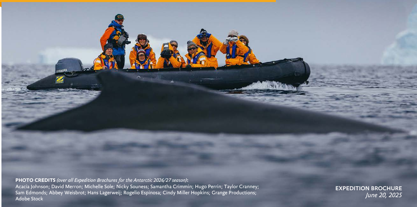
PHOTO CREDITS (over all Expedition Brochures for the Antarctic 2026/27 season):