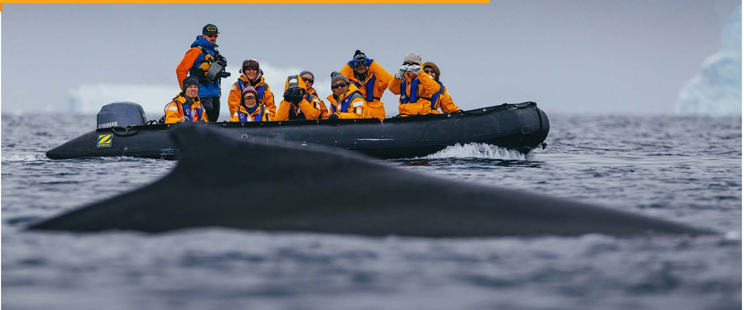
PHOTO CREDITS (over all Expedition Brochures for the Antarctic 2026/27 season):