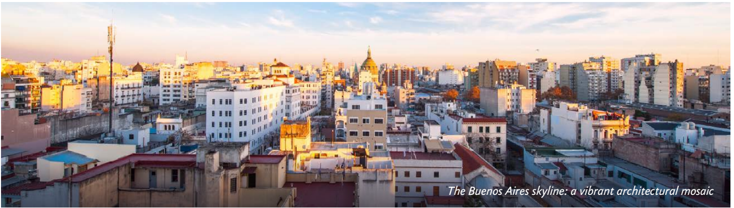
The Buenos Aires skyline: a vibrant architectural mosaic