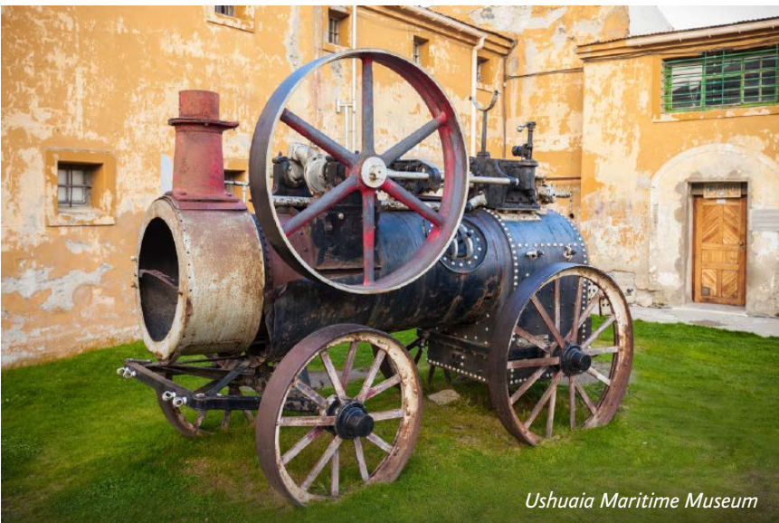
Ushuaia Maritime Museum

To discover the best options for extending your adventure, get in touch with your Travel Professional or a Polar Travel Adviser for seamless, worry-free booking of all trip extensions.