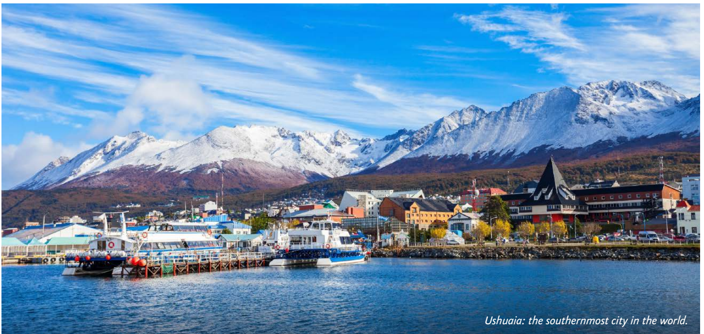
Ushuaia: the southernmost city in the world.

Your included accommodation that's part of your Charter Flight and Hotel Package begins on Day 1 of your itinerary. The specific hotel will be indicated on your final voyage confirmation. If you are arriving prior to Day 1 of your expedition or are staying after the disembarkation day and would like help booking a pre- or post-stay, please contact your preferred travel agent or Quark Expeditions for hotel options. As accommodation space is limited, you are encouraged to request any extra nights as early as possible.