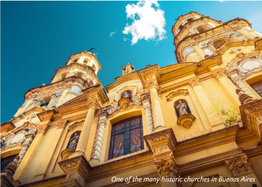
One of the many historic churches in Buenos Aires