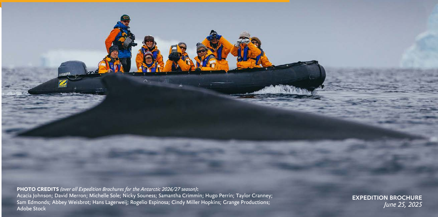
PHOTO CREDITS (over all Expedition Brochures for the Antarctic 2026/27 season):