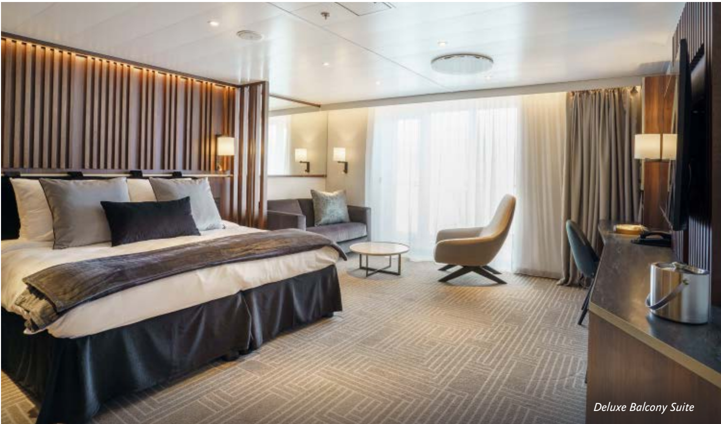
Deluxe Balcony Suite