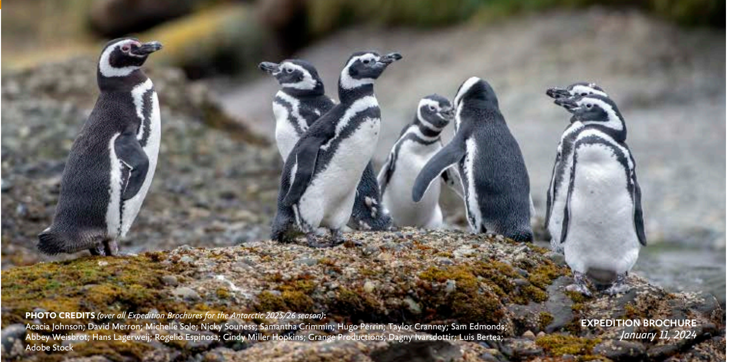
PHOTO CREDITS (over all Expedition Brochures for the Antarctic 2025/26 season):