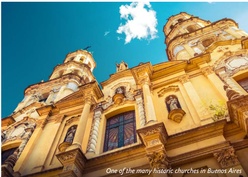
One of the many historic churches in Buenos Aires